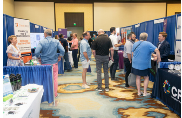
EXHIBIT BOOTH PURCHASE INCLUDES:

MARCH 16 - JUNE 1, 2025 PRICING GOES UP TO $1,999